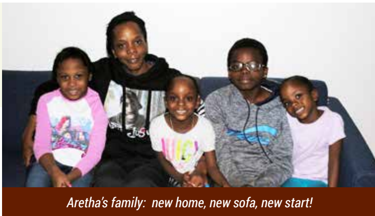
Aretha's family: new home, new sofa, new start!